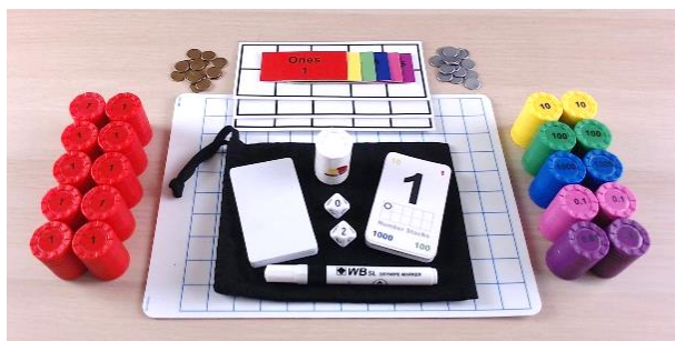
Full Resource Kit